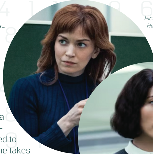
Pictured: Helly R.

Mark is the main character of Severance, and is indeed severed. His Innie is characterized by his happy attitude and supportiveness for his fellow colleagues. He starts as an ordinary member of the Macrodata Refinement (MDR) department, but is soon promoted to department head, which he takes very seriously , despite not fully understanding the true nature of his work. Mark S. is a relatively compliant worker, performing his duties without questioning the system too deeply. However, as the season progresses, his curiosity and skepticism grow, especially after Helly R. repeatedly tries to escape and is unable to leave.