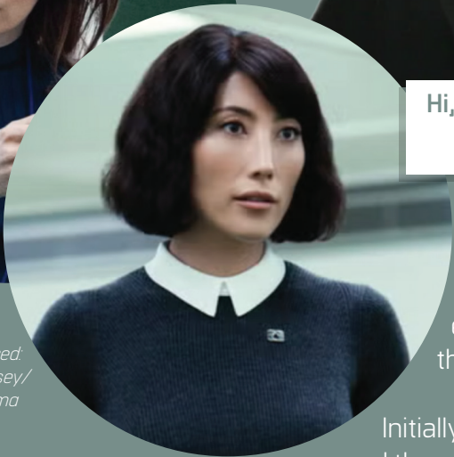
Pictured: Ms. Casey/Gemma

Outie Mark on the other hand, is very depressed after the passing of his wife, Gemma (who we later learn is alive and working at Lumon as Ms. Casey). Mark cries in his car before work, and uses severance as the chance to escape his painful past for 8 hours a day. He lives a quiet, almost monotonous life outside of work, spending time alone at home or having awkward interactions with neighbors. His main social connection is his